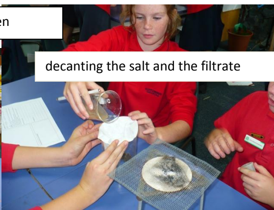
decanting the salt and the filtrate