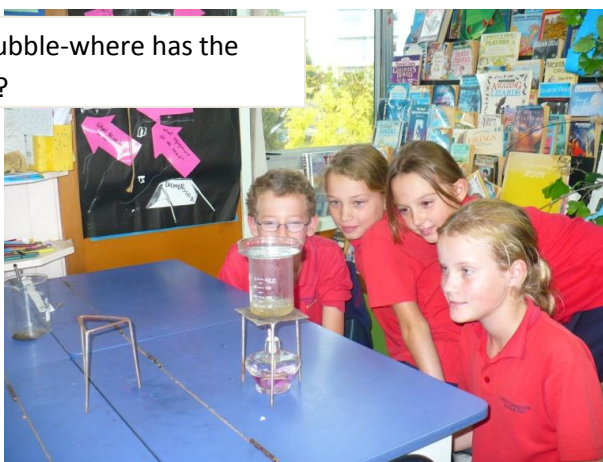
Bubble bubble-where has the salt gone?