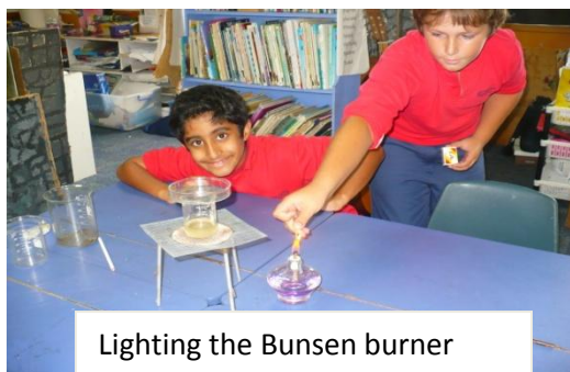
Lighting the Bunsen burner